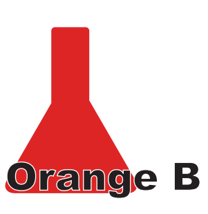
Figure 8. Orange B